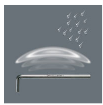
Chrome-plated hexagon L-keys for outstanding surface protection and long service life. High corrosion protection.