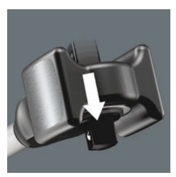
Changing the ratchet direction using a hardened push-through square drive ensures great resilience, since there is no susceptible switching mechanism that could be damaged by hammer blows. This is far more robust than a forward/reverse switch.