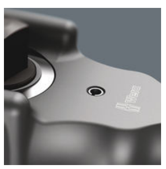
The drop-forged hammer head is permanently pinned to the shaft in a form-fit joint. This guarantees an almost non-detachable positioning of the hammer head on the handle.