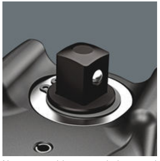
Non-removable sealed and hardened square drive for tough jobs.