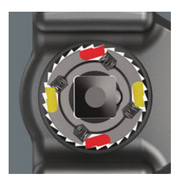
Gives the robust 30 saw teeth the precision engineering effect of 60 fine teeth with a 6° return angle.