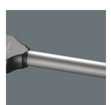
Tubular shaft minimises impact vibrations.