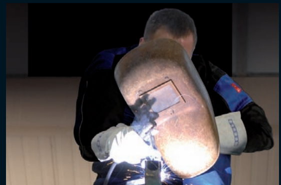
3. MMA / stick electrode welding