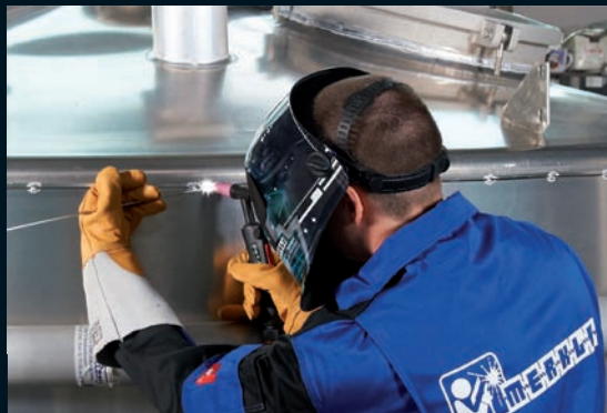
1. Aluminium welding in AC mode