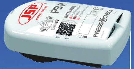
P3 R D