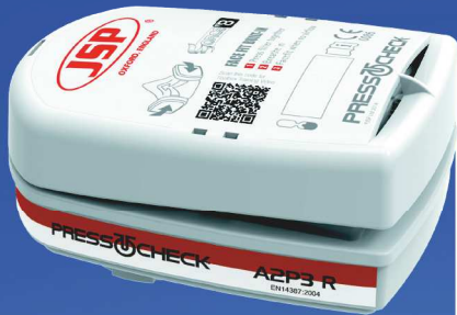
A2 P3 R D