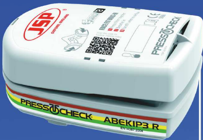
ABEK1 P3 R D

Face-fit testing is reassuring but how can you be sure that you have donned the mask correctly each time you wear it? With PressToCheck™ filters you can instantly check that you have the correct seal every time you don your mask before entering the hazard zone.