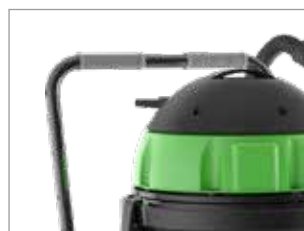
TROLLEY WITH HANDLE