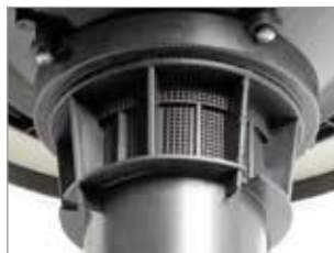
INTEGRATED ANTI-FOAM SYSTEM