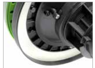
INNOVATIVE HEAD GASKET