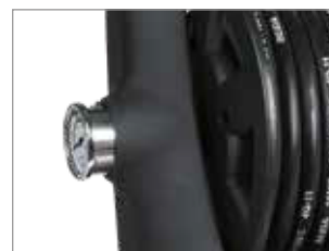
PROFESSIONAL GAUGE (only for I1508 A0-M - I1610 A0-M)