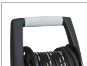
ROBUST AND ERGONOMIC HANDLE