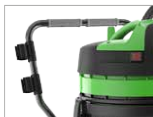
TROLLEY WITH HANDLE