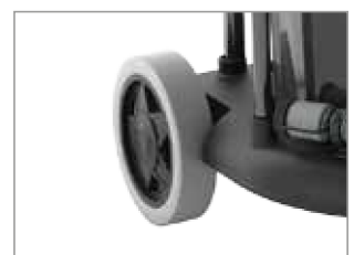
LARGE REAR WHEELS WITH TYRES